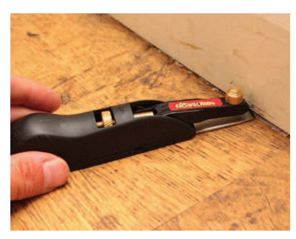
Skirting Easyscribe is perfect for marking skirting to fi an uneven fl can see their point. A nut holds the lead in place (below)