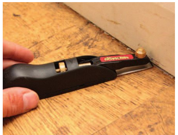
Skirting Easyscribe is perfect for marking skirting to fit an uneven fl can see their point. A nut holds the lead in place (below)